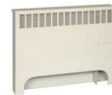
Wall Panel Heater