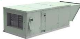
Make Up Air Unit