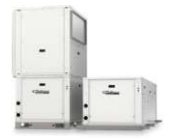
Water Source Heat Pumps